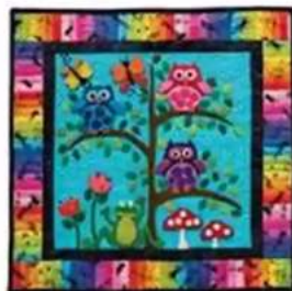
Three on a Tree 51