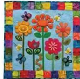
Flower Festival 45