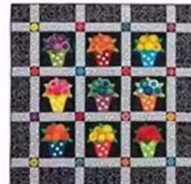
Spotted Pots 60

When it comes to quilts, the Cool Cotton Whimsical Wool Quilts are in a league of their own. The perfect blend of comfort, style, and durability, these quilts offer everything you could ask for.