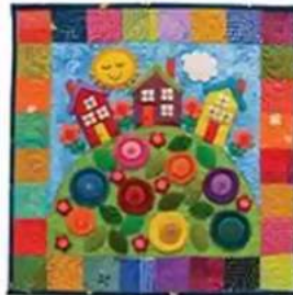
The Neighborhood 39