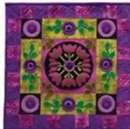
Tulip Medallion 57