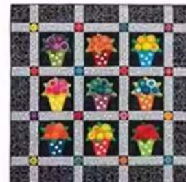
Spotted Pots 60

Quilts have always been an integral part of home decor, providing both warmth and aesthetic appeal to any room. The market is flooded with various types of quilts, but there is one in particular that stands out - the Cool Cotton Whimsical