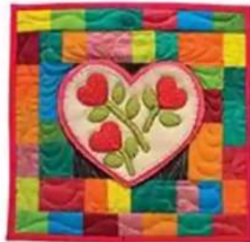
Heart Flowers 37