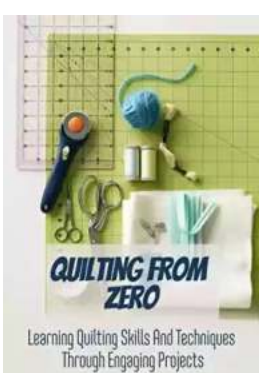
Discover the Joy of Learning Quilting Skills and Techniques Through Engaging Projects