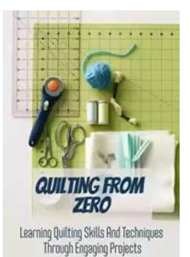
Discover the Joy of Learning Quilting Skills and Techniques Through Engaging Projects